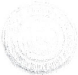
PRINCIPAL Sree Narayana College of Education Muvattupuzha