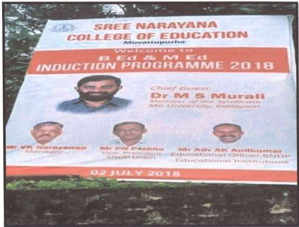
INDUCTION OF B.Ed & M.Ed. 2 nd July 2018