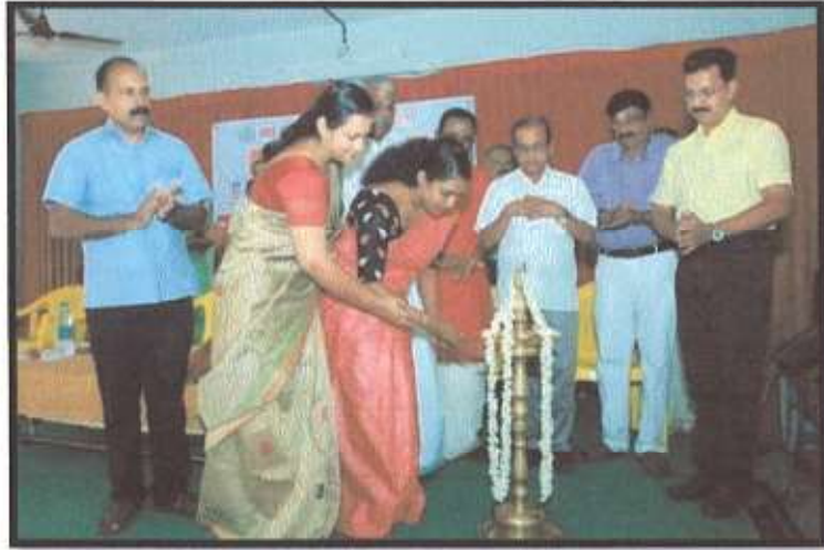
Inaugurating the induction programme 1 st July 2019