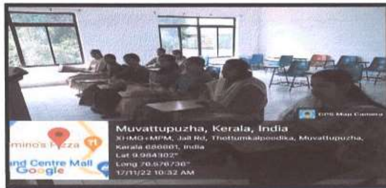
M.Ed new batch attending induction programme on 17 th November 2022