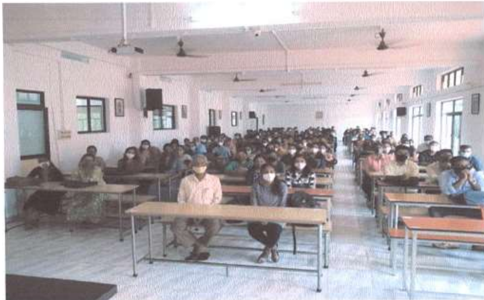
Students of SNCE BED & MED 2021-2023 batch participating student orientation programme on 3/11/2021