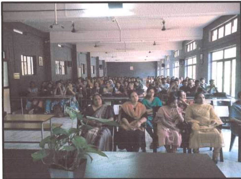
Students of SNCE B Ed batch 22-24 participating in student orientation programme on 1 September 2022