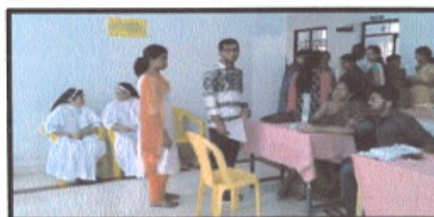
A blood donation camp at Sree Narayana College of Education in Collaboration with HDFC Bank and SH Medical Centre, Kottayam on 27-10-2018

A blood donation camp was organised at SNCE in collaboration with HDFC Bank and SH Medical Centre. The primary objective of the camp was to encourage student-teachers to participate in blood donation, thereby contributing to the noble cause of saving lives. The event saw active participation from both teaching and non-teaching faculty members and student teachers. Approximately 20 individuals generously donated blood during the camp. Additionally, many others expressed their willingness to donate, although specific health concerns prevented them. Despite the challenges faced by some individuals, the overall endeavour succeeded in motivating prospective teachers to volunteer for blood donations. The camp served as a platform to raise awareness about the importance of blood donation and instilled a sense of social responsibility among the SNCE community. Through their contributions, participants demonstrated their commitment to positively impacting society and saving lives.