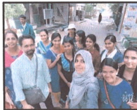
Four-day Study Tour—Mysore, Malpe, Chikmagalur organised by SNCE, Muvattupuzha from 03-01-2019 to 07-01-2019