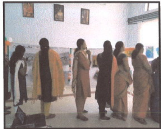
'OUR SOUL DEARS' - Homage to Pulwama Martyrs' by English Education, Sree Narayana College of Education on 1-03-2019

As a tribute to the soldiers martyred at Pulwama, the English Education department organised a commemoration titled 'Our Soul Dears-Homage to Pulwama Martyrs'. The event was inaugurated by the secretary of the college. The commemoration featured exhibitions of military medals and badges, publications on soldiers and war, collages on patriotism, pencil drawings, and films. These displays served as a poignant reminder of the sacrifices made by our soldiers and highlighted the importance of honouring their memory. The immersive atmosphere, depicting war fields and patriotic themes, revitalised the sense of patriotism among the organisers and participants. The event provided a platform to express gratitude and respect for the brave soldiers who lost their lives in the Pulwama attack, fostering a spirit of unity and reverence among all attendees.