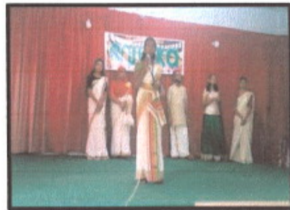
Kerala Piravi Celebrations by Vedika Club, Sree Narayana College of Education on 1-11-2018

The Vedika club at Sree Narayana College of Education celebrated the 62nd Kerala Piravi, offering an enjoyable experience for student teachers. The event featured a variety of programs showcasing the rich culture of Kerala. Vedika members delighted attendees by dressing up as characters from Kerala's history and famous Malayalam novels, adding a colourful and lively touch to the celebration. Additionally, competitions like Malayali Manka and Malayala Sreeman were organised for student teachers in various subjects, fostering a sense of team spirit and friendly competition. The event was a vibrant tribute to Kerala's heritage and traditions, allowing student teachers to immerse themselves in the state's cultural richness. Overall, the celebration of Kerala Piravi was a memorable and engaging experience for everyone involved.