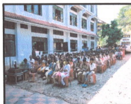
A street play named 'NAMMAL JANANGAL' (We, the people) by Kerala Shasthra Sahithya Parikshath on 12-02-2019