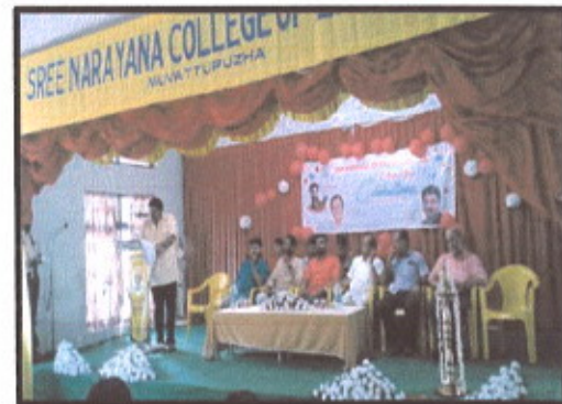
College Day celebrations by Sree Narayana College of Education on 27-03-2019