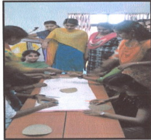
Workshop on 'CHEKKUTTYPAVA' By Sree Narayana College of Education on 07-02-2019

During the community living camp, a session on Chekkuttypava making was conducted, with a team of student teachers serving as resource persons. These student teachers were already trained in this traditional art form. They demonstrated the process of making Chekkuttypavas using cloth and thread to the other student teachers. This hands-on activity provided a memorable and enriching experience for everyone involved. Through the session, student teachers had the opportunity to learn about the cultural significance of Chekkuttypava making and develop new skills in this traditional craft. It fostered a sense of companionship and appreciation for Kerala's rich artistic heritage. Overall, the activity added a meaningful dimension to the community living camp, allowing participants to connect with Kerala's culture tangibly and creatively.