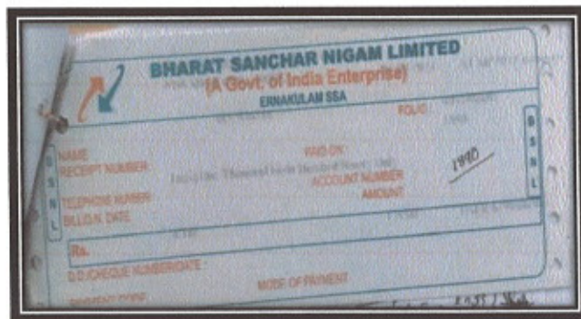
Internet Expenses for Paperless Communications